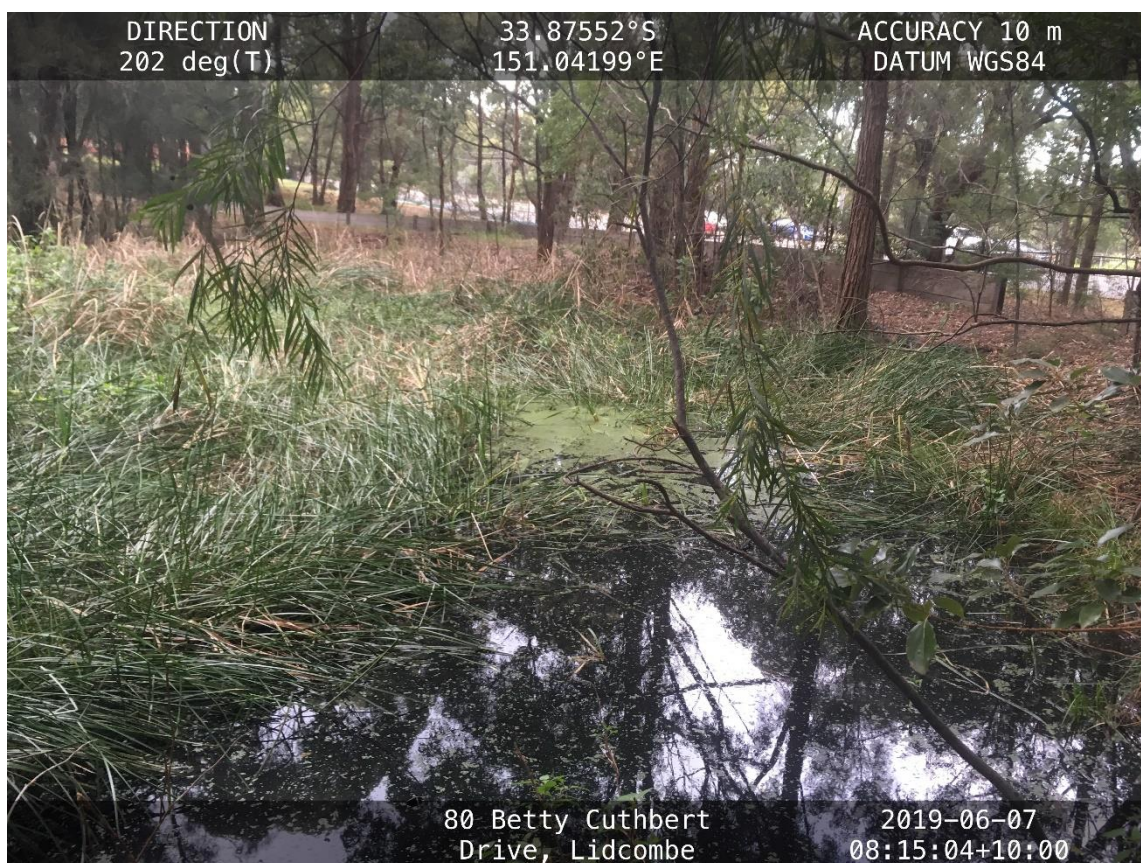
Figure 3: Small pond located within the subject site. Habitat for threatened amphibians is considered unlikely.