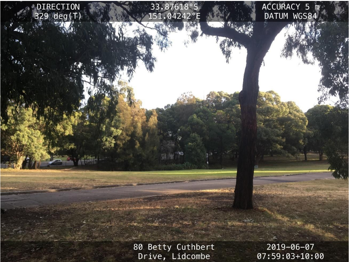
Figure 1: Study site – 80 Betty Cuthbert Drive, Lidcombe