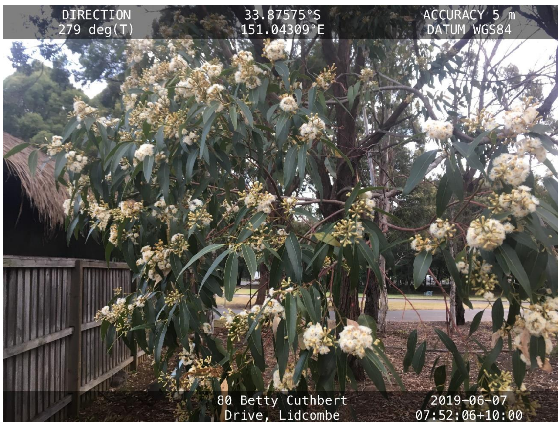
Figure 2: Heavily flowering Eucalyptus microcorys . These flowers attracted a lot of attention from the Rainbow Lorikeets.